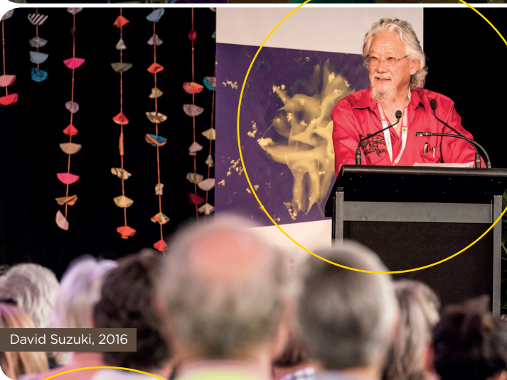
David Suzuki, 2016