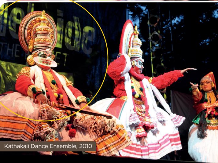
Kathakali Dance Ensemble, 2010