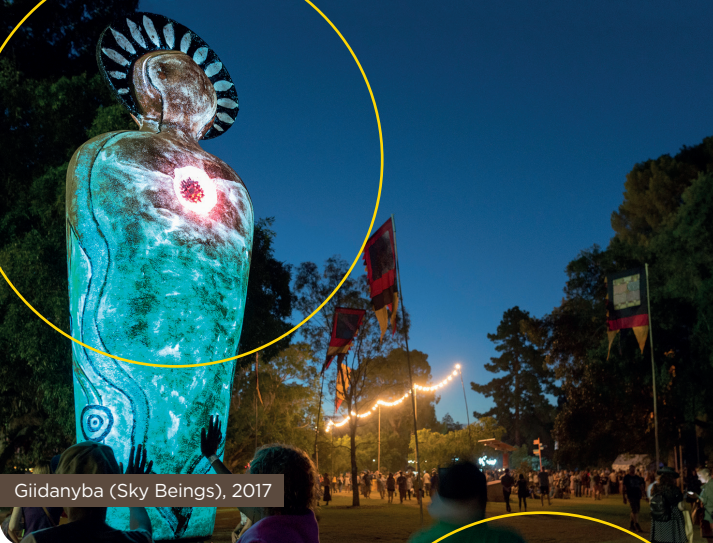
Gidanyba (Sky Beings), 2017